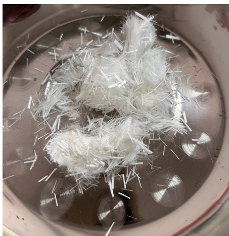
Fig. 1. Glass fiber

Glass fiber was used as replacement as a partial fine aggregate with size not more than 3mm. In this study, chopped glass fiber strand was used. The fiber type was cut into 3mm lengths and added into the mixture in varying amounts between 0 and 0.5%. Figure 1 shows picture of glass fiber.