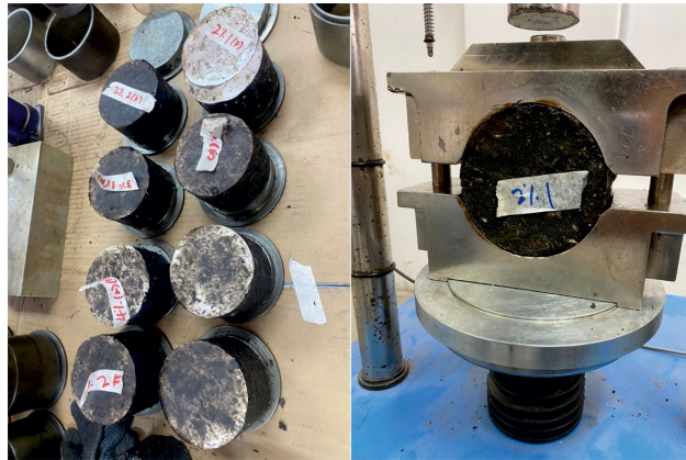
Fig. 2. Sample for Marshall stability test