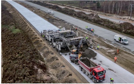
Fig. 2. Concrete pavement using Wirtgen 1900 with the capability of 800 running meters per day.

The concrete pavement set is Wirtgen 1900 composed of a set of 3 machines for pavement, consecutively, the lower and the upper layer and applying the curing agent. The texturing process was performed mechanically by brushing the upper layer in the time of from 12 to 24 hours from the beginning of pavement process.