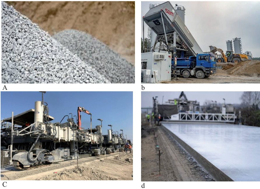
Fig. 3. The supply chain of the concrete mix to the construction site, a-gathering materials, b-production of the mix at the mobile concrete batching plant, c-concrete pavement, d-concrete curing process.

Fig. 3 illustrates the chain links of the supply chain of the concrete mix to the construction site in the analysed case.